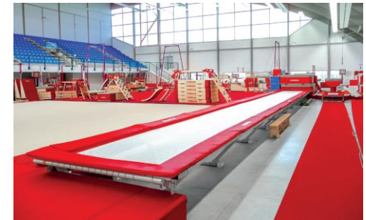
On feet Acrotramp