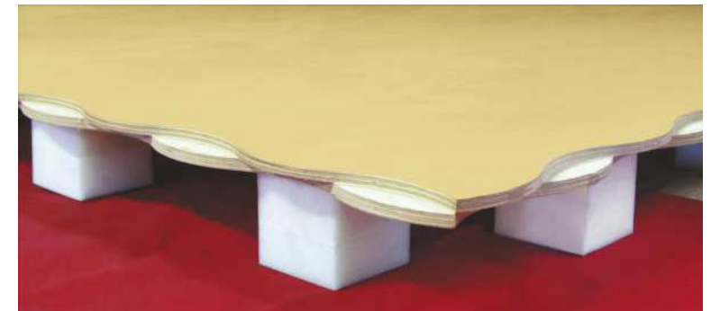
Close-up of waved-edge panels