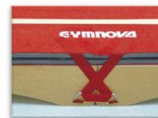
Self-gripping bands and metal pins