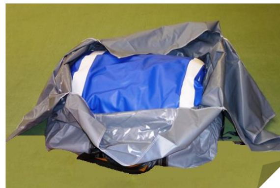
2. Unpack and check the packages