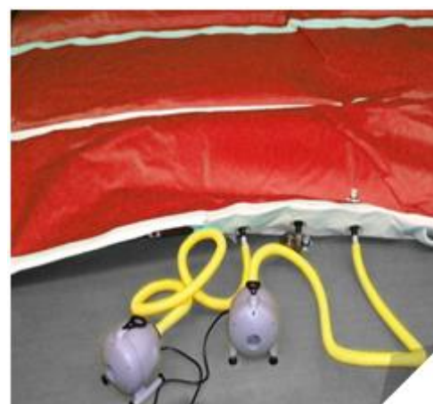
4. Inflate the track

2 motors for a quick inflation/deflation