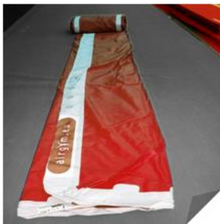
3. Unfold the track

Track should be unfolded and folded back again flat for an optimal use