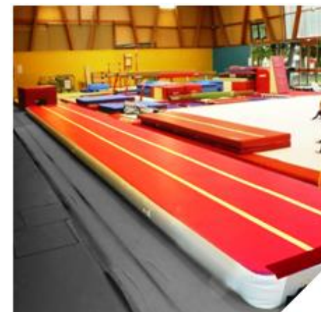
5. Use the track

2 motors for a quick inflation/deflation