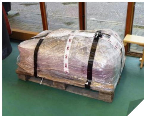
1. Receive the track