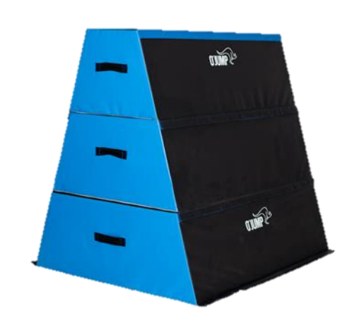
Ref 920 (921+922+923)