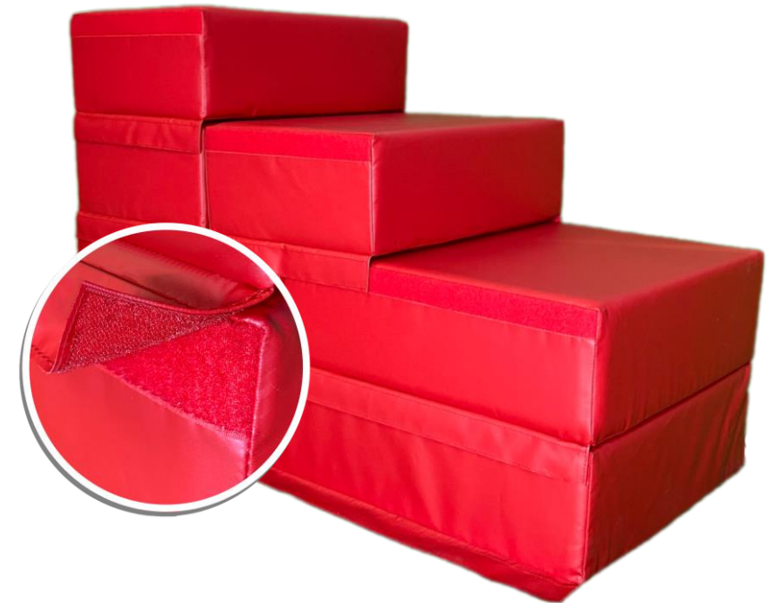
Blocks joined to another by self-gripping strips