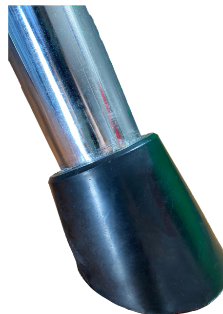
Anti-sliding rubber feet