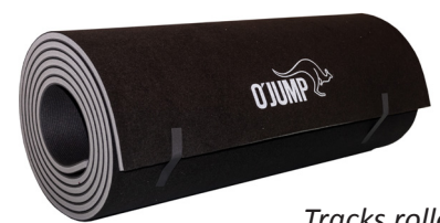
Tracks rolled, space saving

Thanks to the O'JUMP tracks, you can now create a training area dedicated to learning gymnastics, urban gymnastics, cheerleading or circus.