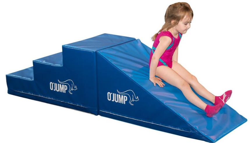
Ref. 061 + Ref. 050